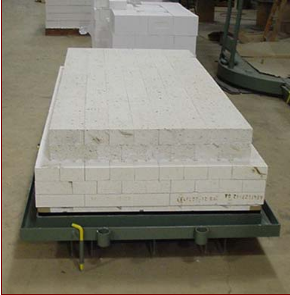
Assembly, July 2003