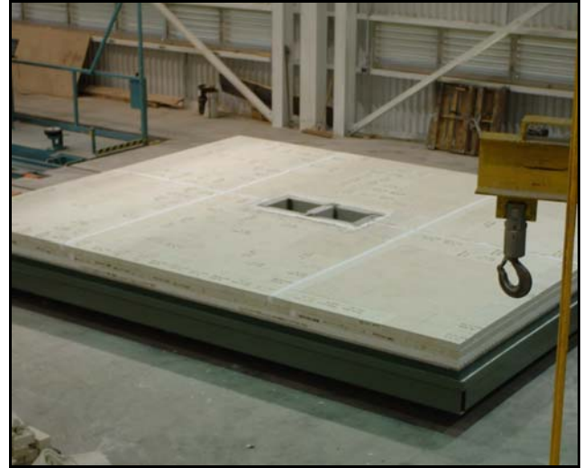
16' x 18' kiln car for 1610°C – after 1 year service