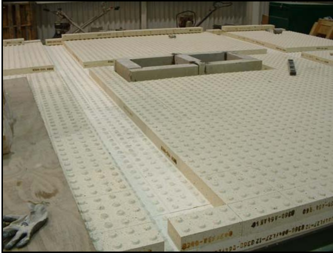
16' x 18' kiln car for 1610°C – as assembled