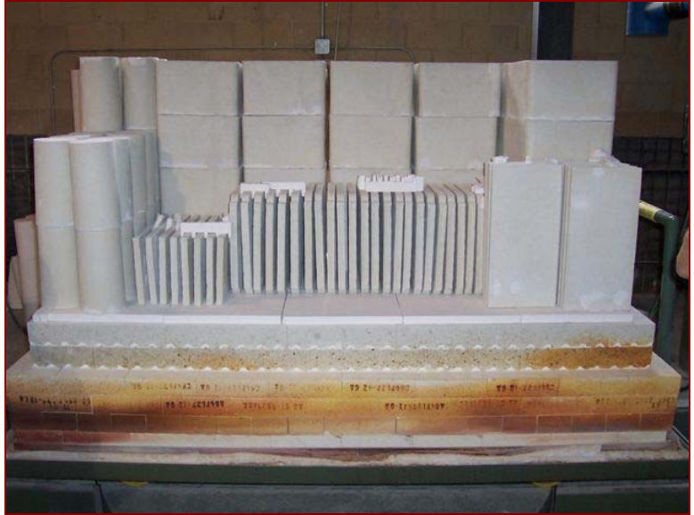
Recent Photo, No Maintenance